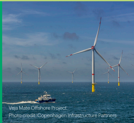
Veja Mate Offshore Project